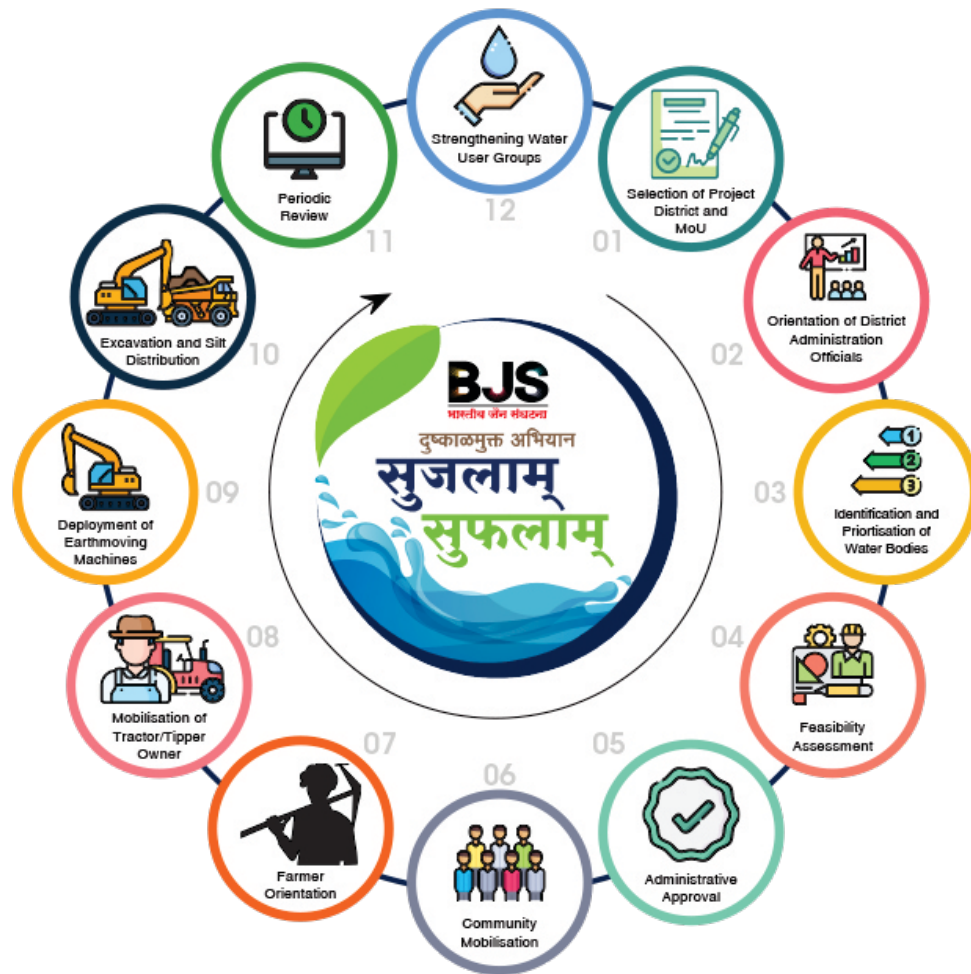
Fig. 1. The process of Sujalam Suphalam is of participatory and is inclusive in nature, where the district authority is involved in decision making along with the community members. This process depicts the effective liaisoning methodology that has been applied in this programme.